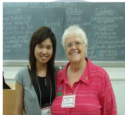
Teaching English to Chi-