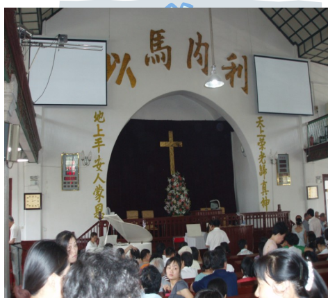
Worship in Jinan, China